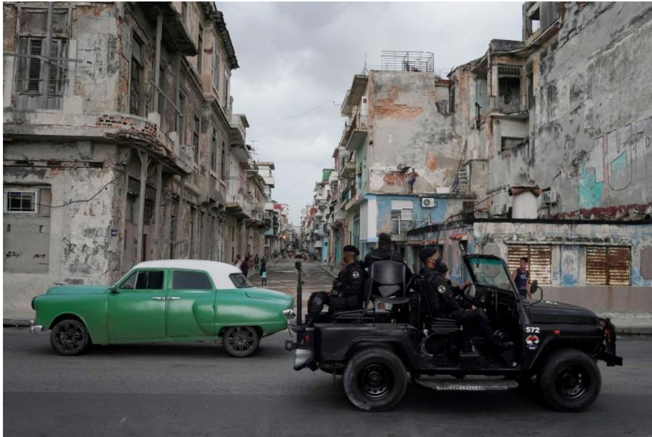
In downtown Havana, Cuba, July 2021